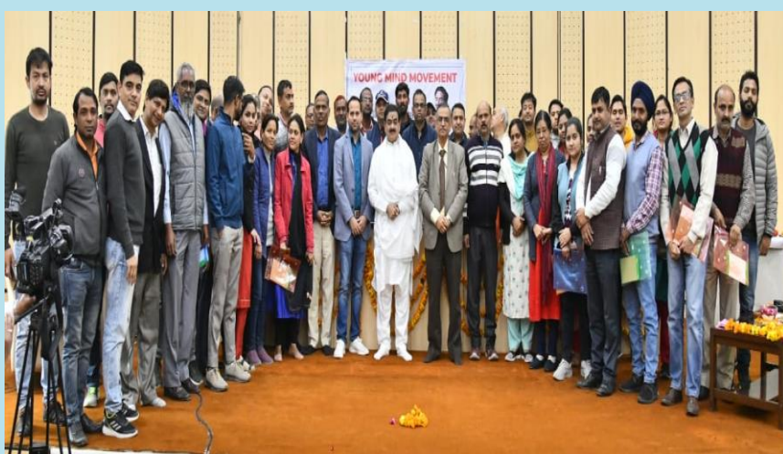
Group photograph with speaker