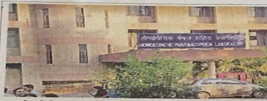
भारतीय चिकित्सा एवं होम्योपैथी भेषज संहिता आयोग में देने प्रशिक्षण

एलोपैथिक के बाद अब आयुर्वेदिक, होम्योपैथिक और यूनानी दवाओं की गुणवत्ता कायम रखने और जांच को लेकर देश के औषधि निरीक्षक, खाद्य सुरक्षा अधिकारी एवं विश्लेषकों को पांच दिवसीय विशेष प्रशिक्षण दिया जाएगा। कमला नेहरूनगर सेक्टर-23 स्थित भारतीय चिकित्सा एवं होम्योपैथी भेषज संहिता आयोग के कार्यालय में यह प्रशिक्षण 20 से 24 मार्च तक दिया जाएगा। पहले चरण में गुजरात, महाराष्ट्र, गोवा, दमन दीव, मध्यप्रदेश और राजस्थान प्रदेश के औषधि निरीक्षक, खाद्य सुरक्षा अधिकारी और विश्लेषकों को प्रशिक्षण दिया जाएगा। प्रशिक्षण के दौरान दवाओं की गुणवत्ता बरकरार रखने, मानक एवं नियमों के बारे में विस्तार से बताया जाएगा। इसके लिए आयोग के अनुभवी विज्ञानियों का पैनल गठित किया गया है। यह प्रशिक्षण पूरी तरह आवासीय होगा। आयोग की प्रयोगशाला में